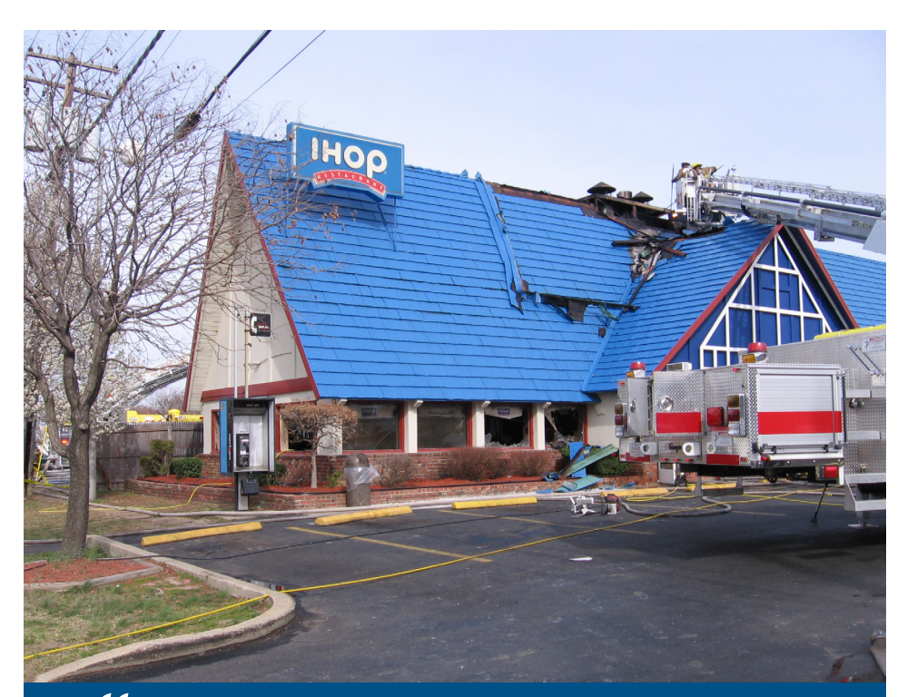
With either coinsurance or agreed value policies, a statement of business income values must be filed periodically (annually with agreed value). 39

When a manufacturer's insurance program incorporates both salesvalue of-production business income coverage and a sellingprice endorsement for finished stock, the insurance company may seek to reduce the business income loss by applying a credit to the measured sales value of production loss for the "margin" attained through the payment of the selling price claim for the finished stock. This "duplication of coverage" issue occurs when a loss simultaneously affects both finished stock and the ability to manufacture, but would not come into play if only one of those components was affected in a loss.